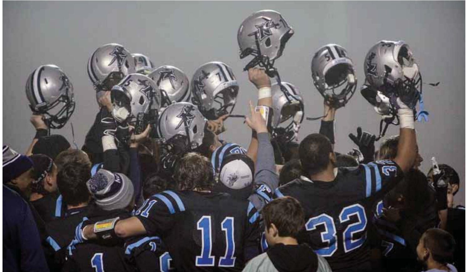
North Torrance took on top-seeded Bishop Diego in the CIF Northwest Division semifinals and won 28-14. The Saxons will face Nordhoff for the championship next Saturday in the CIF Northwest Division semifinals. Seen here: the North Torrance Saxons celebrate after winning their CIF Semifinal against Bishop Diego. Read more on page 8.