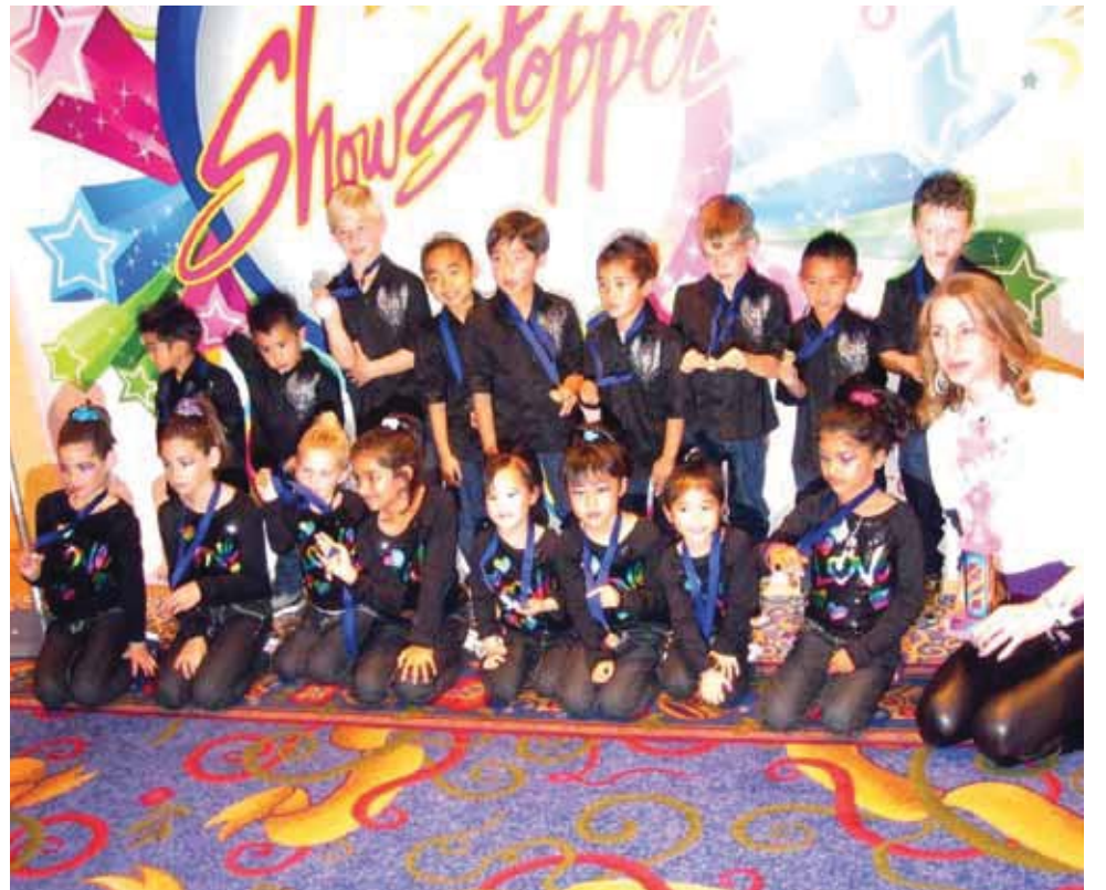
National Champions - Hip Hop Team age 5 to 8 year olds.