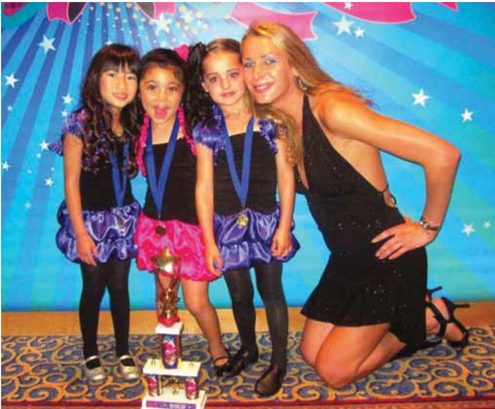
Mini Jazz Team age 4 to 6 years old.